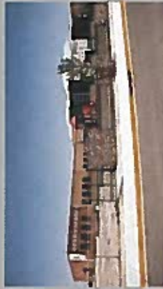
Chester Jordan Elementary