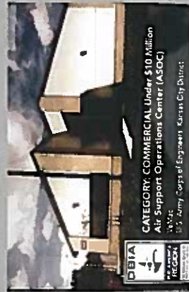
Air Support Operations Center

Tech H2O El Paso Water Utilities Water Resource Learning Center