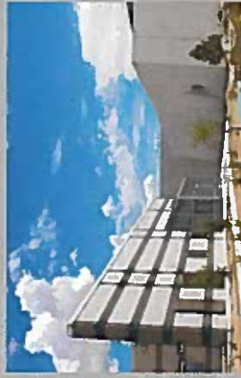
Tech H2O Center

First Thin Wall Concrete Structure in El Paso