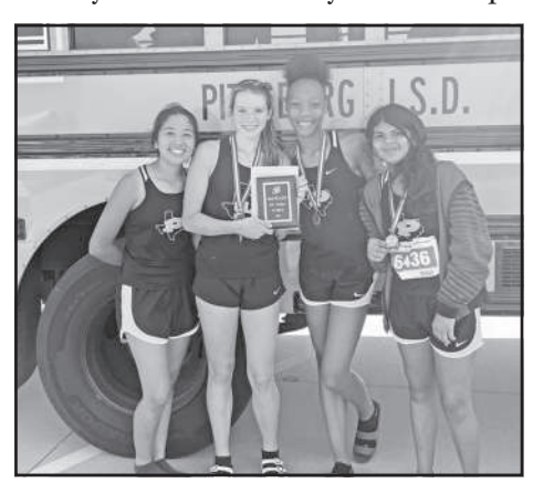
JV Pirates JV Lady Pirates