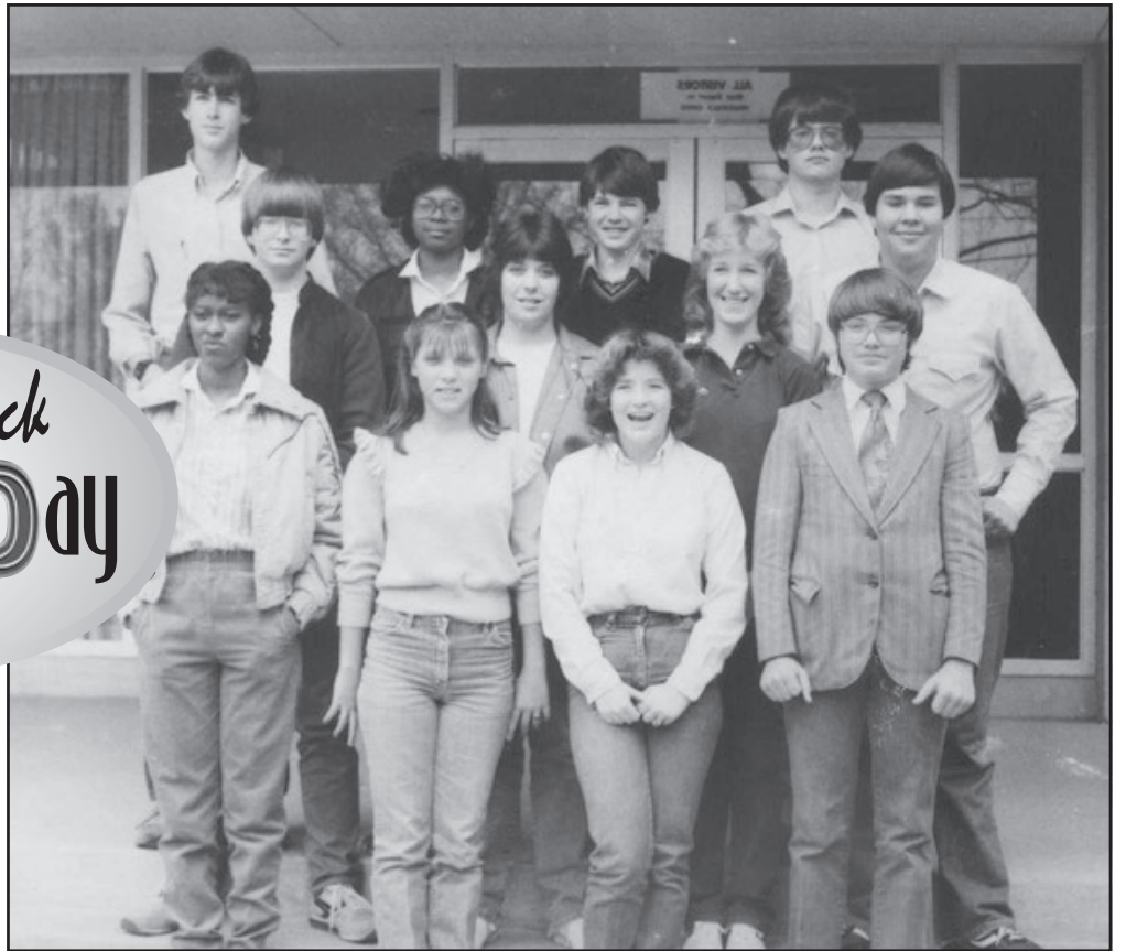
This picture was taken on the steps of Pittsburg High School. Can you name the students in the picture? If so, please refer to our Throwback Thursday Facebook page and let us know the students' names in the picture, approximately what year it was taken and what high school group it is.