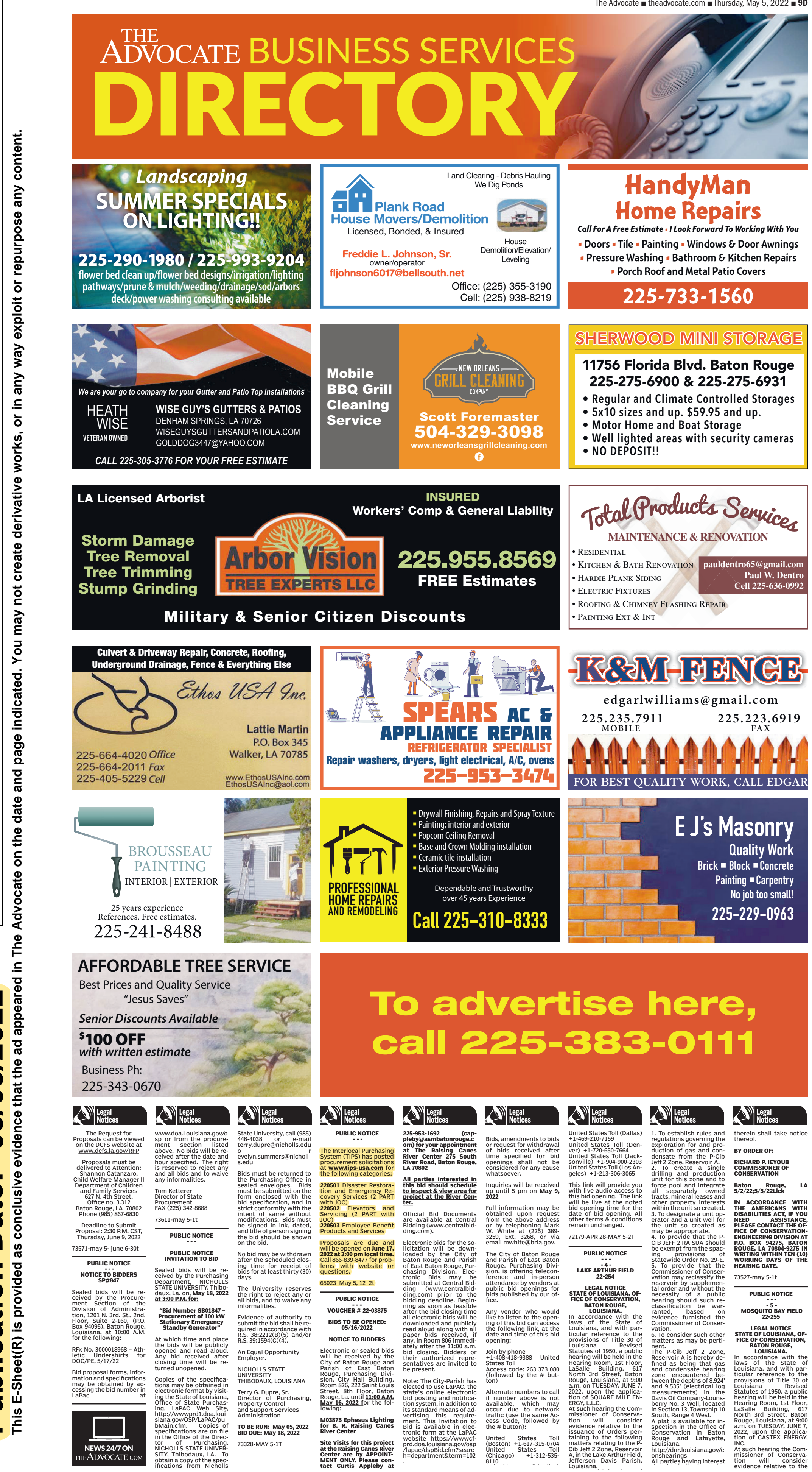
The Advocate ■ theadvocate.com ■ Thursday, May 5, 2022 ■ 9D