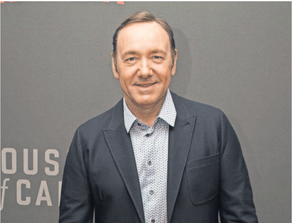
Allegations of sexual abuse have cost Kevin Spacey his relationship with Netflix and his hit series, "House of Cards."

"Nothing could've prepared my son for how that sexual assault would make him feel as a man," she said. "It harmed him and it cannot be undone."