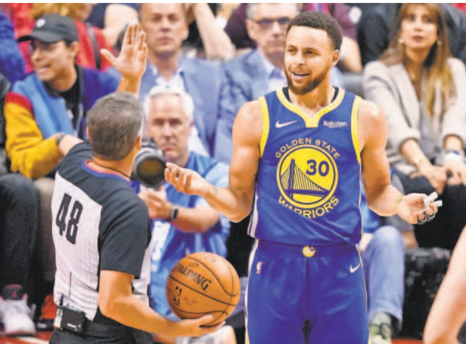
Stephen Curry “leads with his example, his work ethic, his humility,” Warriors coach Steve Kerr says. “The players all love him.”

“Nothing changes,” he said. “Stay consistent with my approach every year, whether it’s in training camp or in the Finals, everything in between. Just trying to boost confidence, create the right perspective going into each game.