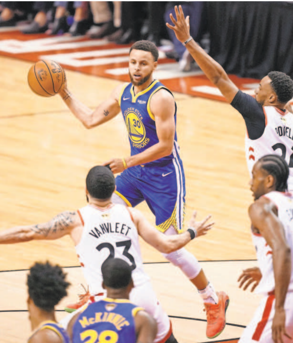
Warriors guard Stephen Curry passes the ball during the fourth quarter Sunday as the Raptors employed a box-and-one defense.

“In ninth grade a team played one against me. Very proud to announce that. I had a box-and-one, just like