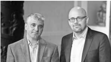
Authors Steven Levitsky, left, and Daniel Ziblatt.

At the root, they say, is racism, particularly racism inspired by passage of the 1965 Civil Rights Act. Couple that with the passage the same year of landmark immigration reform, which empowered non-white Americans and created an animus among white Americans that has triggered a series of moves to counter diversity and preserve white influence. The authors deftly mine world history for other examples of how politicians have distorted their nations' less-robust