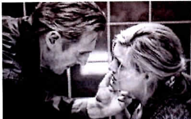
Bryan Mills (Liam Neeson) and his daughter (Maggie Grace) find themselves facing down the bad guys again in Taken 3.

Grace is noticing a trend. "Yes, Liam's screen progeny are pretty endangered," says the actress, 31. "We all seem to be in peril." Protecting loved ones is part of the territory for Neeson, 62, who has turned into an unlikely action star. Kim's kidnapping in 2009's Taken sent Neeson's character on a gangster-killing spree to free her from human trafficking. The film reaped $145 million at the box office, and Neeson's action-star persona was sealed. In 2012's Taken 2, Kim had to help fight off more gangsters, who kidnapped her mother and Mills. Naturally, there's even more daughter disturbances in the third installment. Grace believes Neeson's sincerity allows moviegoers to accept him as a father figure, despite being a CIA operative or hitman. "He's this action hero, but there's a sense of paternal protection about him. He has this presence, like the father everyone wishes they had," Grace says. "He has a sense of strength but tenderness." Run All Night director Jaume Collet-Serra says the family angle