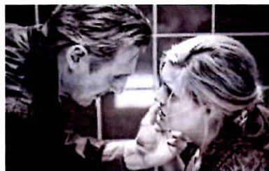
Bryan Mills (Liam Neeson) and his daughter (Maggie Grace) find themselves facing down the bad guys again in Taken 3 .

Grace believes Neeson's sincerity allows moviegoers to accept him as a father figure, despite being there's a sense of paternal protection about him. He has this presence, like the father everyone wishes they had," Grace says. "He