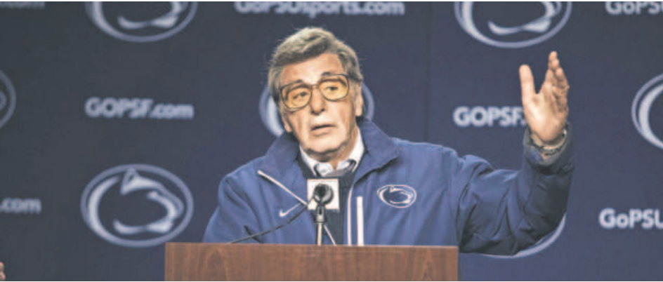
Penn State’s legendary football coach was a contradictory man, Al Pacino says: “He goes to denial and then guilt and then a kind of contrition.”