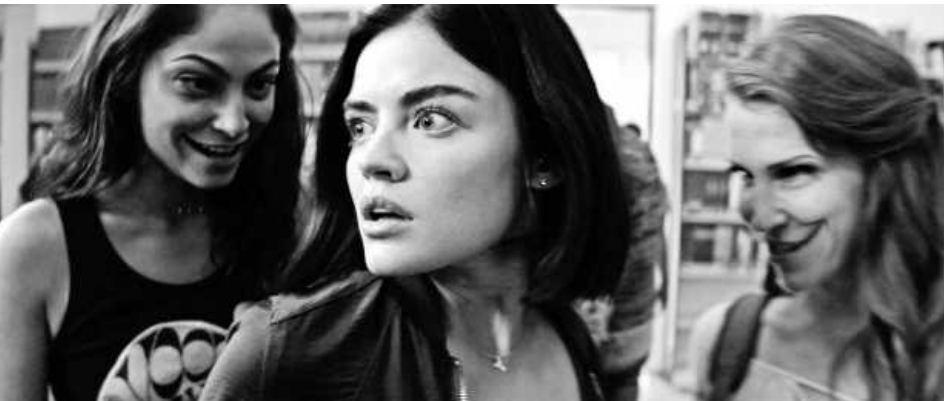
Young Olivia (Lucy Hale, center) finds those bizarre Joker-like grins less than enchanting in the horror thriller “Truth or Dare.”

In the new horror film Truth or Dare , there’s no Freddy or Jason, no masked killer, and no nutcase with an ax to grind — or even an ax to wield. Instead, the creepiest thing is a truly wicked grin. Truth or Dare (now showing) takes the infamous party game and makes a killer thriller, with a bunch of college-age kids forced to play a deadly ongoing version after a curse is cast upon them while they’re in Mexico for spring break. The rules: Each person takes turns being asked “Truth or dare?” — and if they lie, don’t do the dare or simply refuse to participate, they die. And each turn involves bystanders or the player wearing a hideously wide, Joker-like grin. “Yeah, it’s a horror movie and there are all the gory, jump-scare moments, but underneath it all, I thought it was really interesting that everyone in this movie is harboring a really dark secret,” says star Lucy Hale. The unnerving grin passed among