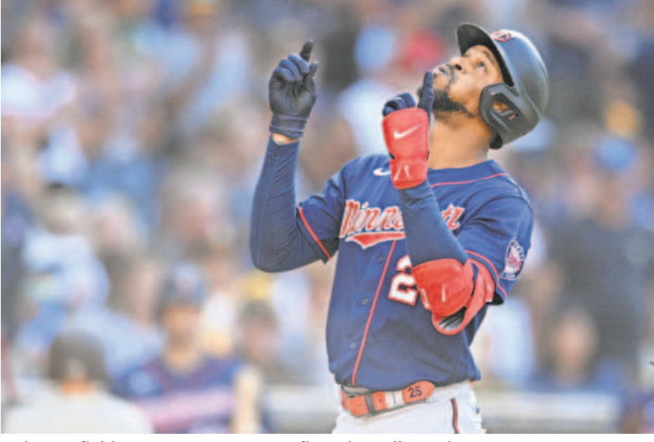
Twins outfielder Byron Buxton was a first-time All-Star in 2022.

So all they get back for Contreras, the best position player on the market not named Juan Soto, is a draft pick when they make him a qualifying offer.