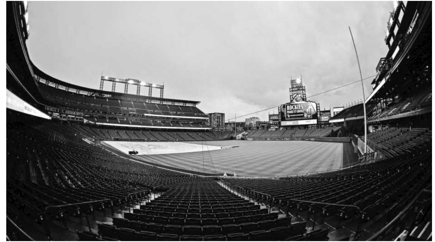
Coors Field in Denver will be the new site of the MLB All-Star Game on July 13.

The unofficial mainstream media arm of the right?