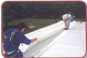
Prefabricated Roofing System

Dry Guarantee • Great Life Cycle Benefits • No Maintenance Program Required • Most Emissive Roofing System At 95% Most Reflective Roofing Product At 85% • Save On Air Conditioned Related Energy Cost • Prefabricated Saving Time, Labor, And Money Best Warranty In Industry • Warranty Includes Consequential Damages And Ponding Water