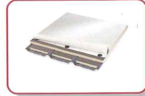
Metal Retro Fit With Insulation

- Jaco Roofing - -Family Owned Texas Company Since 1968 Platinum Contractor