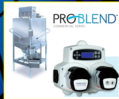
Warewash & Laundry

Myers Supply offers over 30,000 facility supply products available online and in our print catalogs!