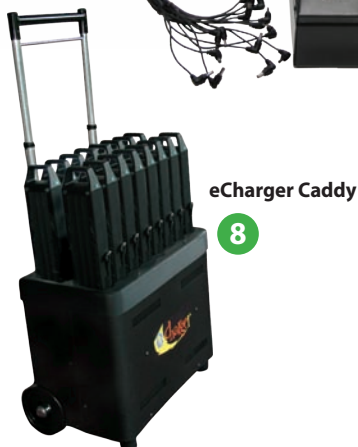
8 eCharger Caddy