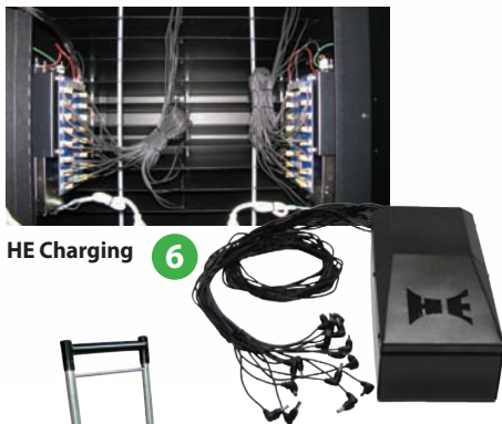
6 HE Charging