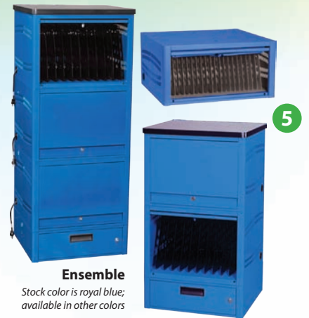
5 Ensemble Stock color is royal blue; available in other colors

http://www.earthwalk.com/solutions/save-up-to-85-in-energy-costs/