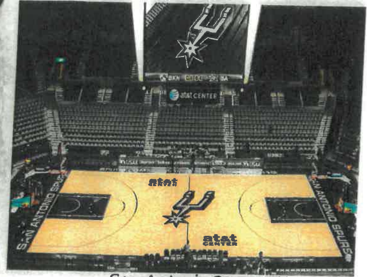
San Antonio Spurs, TX