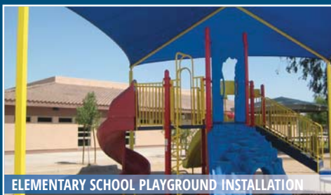
ELEMENTARY SCHOOL PLAYGROUND INSTALLATION