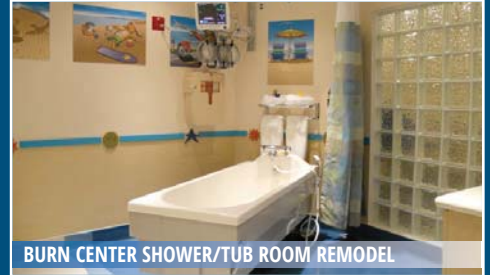
BURN CENTER SHOWER/TUB ROOM REMODEL