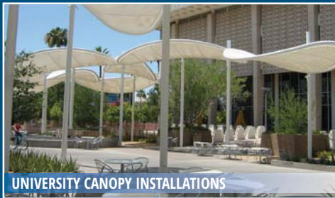
UNIVERSITY CANOPY INSTALLATIONS