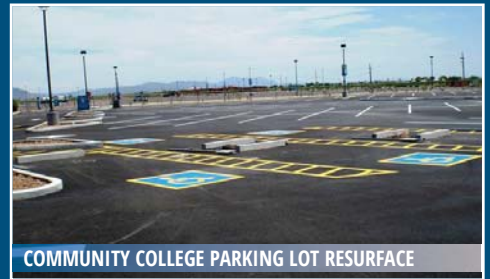
COMMUNITY COLLEGE PARKING LOT RESURFACE