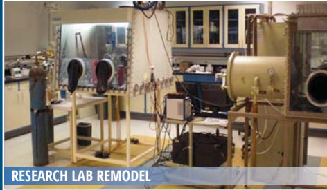
RESEARCH LAB REMODEL