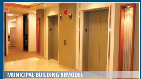
MUNICIPAL BUILDING REMODEL