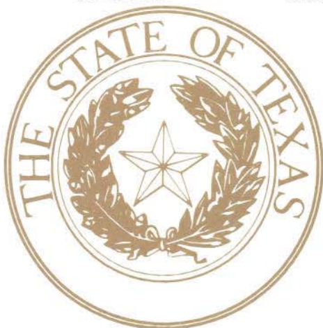
Elton Bomer Secretary of State

Dated: October 05, 2000 Effective: October 05, 2000