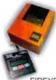
FIREYE FLAME MONITOR AND DISPLAY