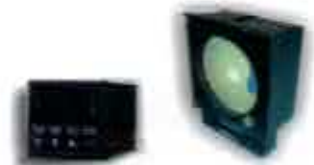
RECORDERS AND UDC'S