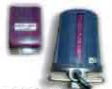
HONEYWELL FLAME SAFEGUARD AND AMPLIFIERS