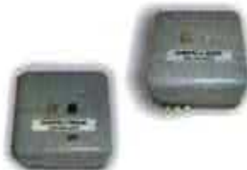
HONEYWELL FLAME RELAYS