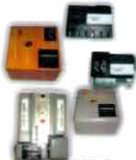
FIREYE BURNER CONTROLS AND MODULES