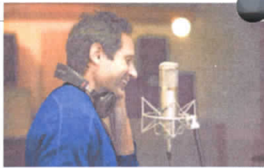
David Duchovny's Hell or Highwater is out May 12.

The album's title track and first single is a love song that harbors no romantic illusions. Duchovny sings, "I said I'd love you forever, come hell or high water/Baby, the flood's in." It's available for digital download. The final song, Positively Madison Avenue , was inspired by seeing Bob Dylan's ad for Chrysler