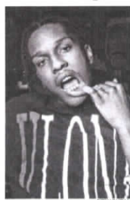
"I don't need the attention of being a celebrity," A$AP Rocky says.

Perhaps self-conscious about seeming cocky, he grins and laughs, changing the subject as he points out a bikini-clad model on