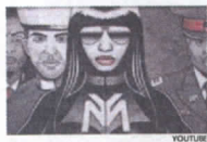
Minaj's Only video angered many.

Tuesday: "I didn't come up w/the concept, but I'm very sorry & take full responsibility if it has off-ended anyone. I'd never condone Nazism in my art."