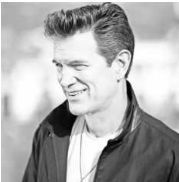
Chris Isaak's First Comes the Night arrives Nov. 13.

thing, I went to breakfast, and there was Robert Plant," he says. "So I thought, 'This town's rocking, man!'" Isaak decided to record in Nashville at the suggestion of Stevie Nicks. "She said it was a fantastic town and the studios and engineers were great." On Isaak's previous album, 2011's Beyond the Sun , he covered songs that had come out of Memphis' legendary Sun Studio, where Cash, Elvis Presley, Jerry Lee Lewis and others cut classic sides in the '50s. If that album was mid-'50s Presley at Sun, First Comes the Night is later Presley at RCA. Down in Flames , for instance, has backing vocals that recalls All Shook Up . Also, Isaak says, " Don't Break My Heart reminds me of a bad Elvis soundtrack to a bad Elvis movie,