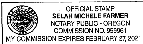
Notary Public-State of Oregon