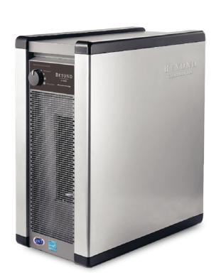
Beyond Guardian Air Purifier

ActivePure Technology for existing HVAC.