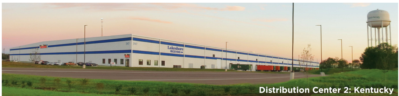
Distribution Center 2: Kentucky

Two generations later, Lakeshore continues to offer the best products and service around—and we're still expanding! In addition to our growing network of over 60 retail stores, we offer multiple mail-order catalogs to meet the needs of parents, teachers and children worldwide. Plus, our full-service website offers instantaneous access to our catalogs as well as free activity ideas, classroom designs for infants through 8th grade and much more.