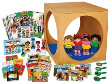
Example: Item # KT9204 - Social-Emotional Competence Support Kit for Toddler Programs built by our Custom Solutions Division.

Custom Solutions Division-- where our team creates a custom approach to meet your unique needs.