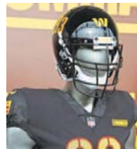
New Washington Commanders uniforms.

“As we kick off our 90th season, it is important for our organization and fans to pay tribute to our past traditions, history, legacy and the greats that came before us,” Snyder said in a statement. “We continue to honor and represent the Burgundy & Gold while forging a pathway to a new era in Washington. Today may mark the first day for the Washington Commanders, but we are and always will be Washington.”