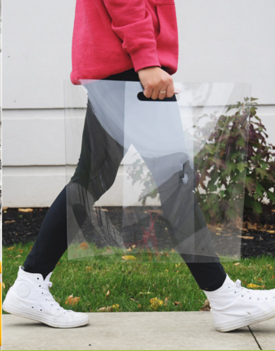
Portable Desktop Shields