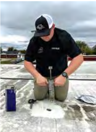
1-Performing Core Sample

Preventing Catastrophic Failures: Our cutting-edge thermal inspections allowed us to detect these anomalies before they became a costly emergency repair or worse. The gypsum roof decking(3), a material used in older roof systems, loses its structural integrity when oversaturated and can unexpectedly fail. Identifying this leak issue potentially averted a catastrophic and dangerous failure of the roofing system.