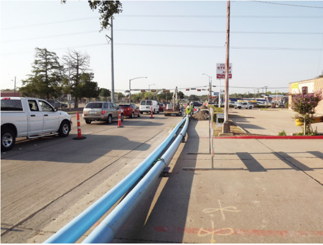
Great value in a contractor being able to upsize a water main while still allowing traffic to flow

“ In some jurisdictions, project restoration costs can exceed two thirds of total project spending. Pipe bursting significantly reduces these costs, meaning more pipe can be replaced. ”