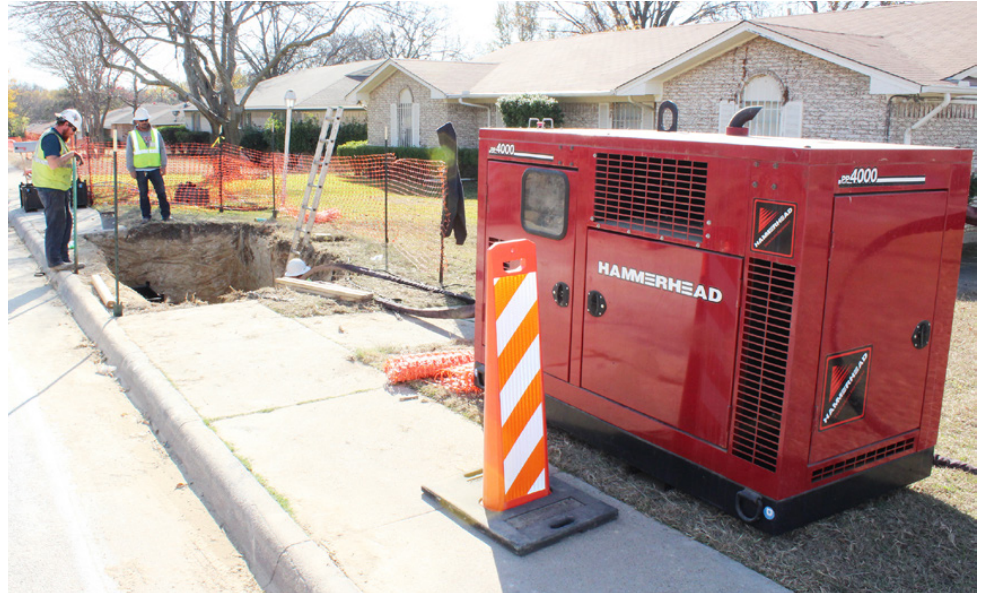
Machine pit dimensions need to be only big enough to accommodate a 4-foot by 12-foot shore box, at a depth not much deeper than the lay of pipe being replaced

equally viable for potable waterline replacement. Even within the state of Texas, one of the world's largest pipe bursting markets, it is still possible to find city engineers who admit they did not know pipe bursting is also well suited for waterline rehabilitation.