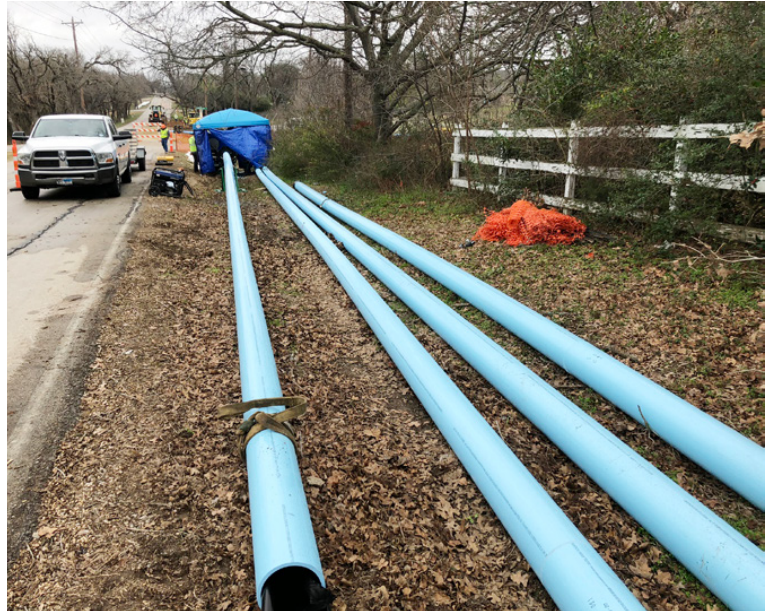
Joint fusing and pipe staging area. Sticks of PVC are joined to full run length prior to the day of the burst, stored conveniently out of the way near the insertion point