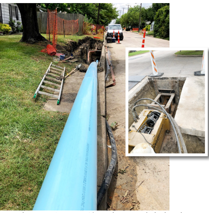
Minimal excavation/restoration. The pipe bursting method reduces digging requirements are reduced as much as 90 percent compared to an open cut “dig and replace” method. The only excavation required is for the pulling machine, insertion pit and accesses to service connections

Using proven well-established trenchless technology methods such as pipe bursting to install new longer lasting pipe materials has the added benefits of dramatically reducing impacts on traffic flow, businesses and residences, decreasing carbon emissions due to a much smaller construction footprint, and greatly reducing the costs associated with excavation and surface restoration. By greatly decreasing these restoration costs, more “bang for the buck” can be achieved so that substantially more AC and CI pipe can be replaced using the same funding already in place.