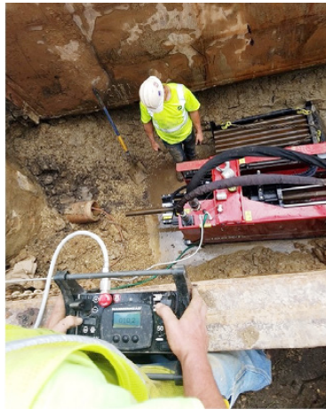
Enhanced safety. Some modern pulling machine designs free the operator from the pit, offering a superior view of the operation and of worksite surroundings during an installation

parking lots and landscaping. Overall construction impacts to the community are minimized while achieving the larger diameter pipe replacement sufficient to meet demand. Lateral pipe-bursting rehabilitation offers a portable, quick and cost effective method for replacing 1/2 – 6-inch laterals when used in conjunction with an overall replacement program.