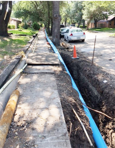
The majority of the insertion pit does not need to be much wider than the pipe itself