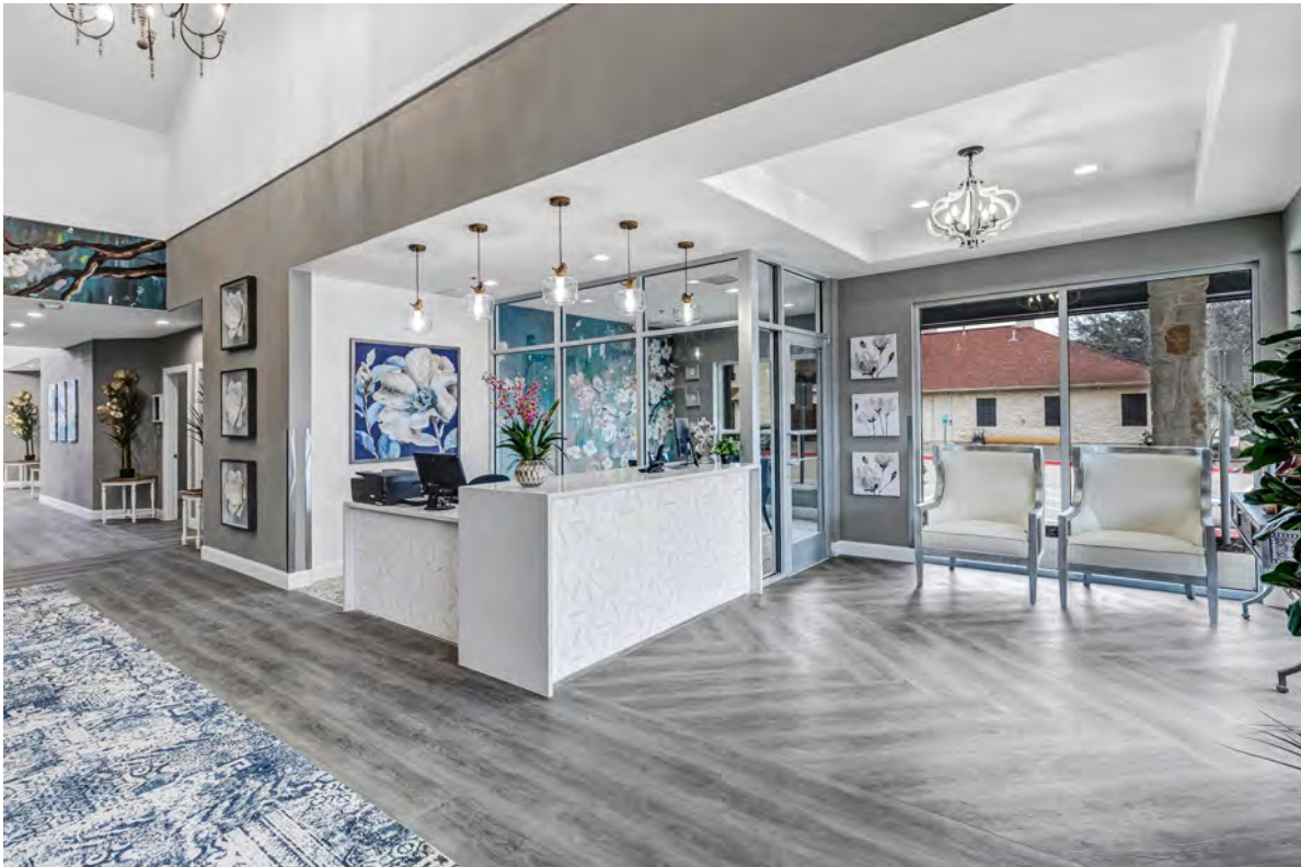
Project photos shown represent projects completed by current team members of Specialty Mod Construction and may or may not be a project of Specialty Mod Construction