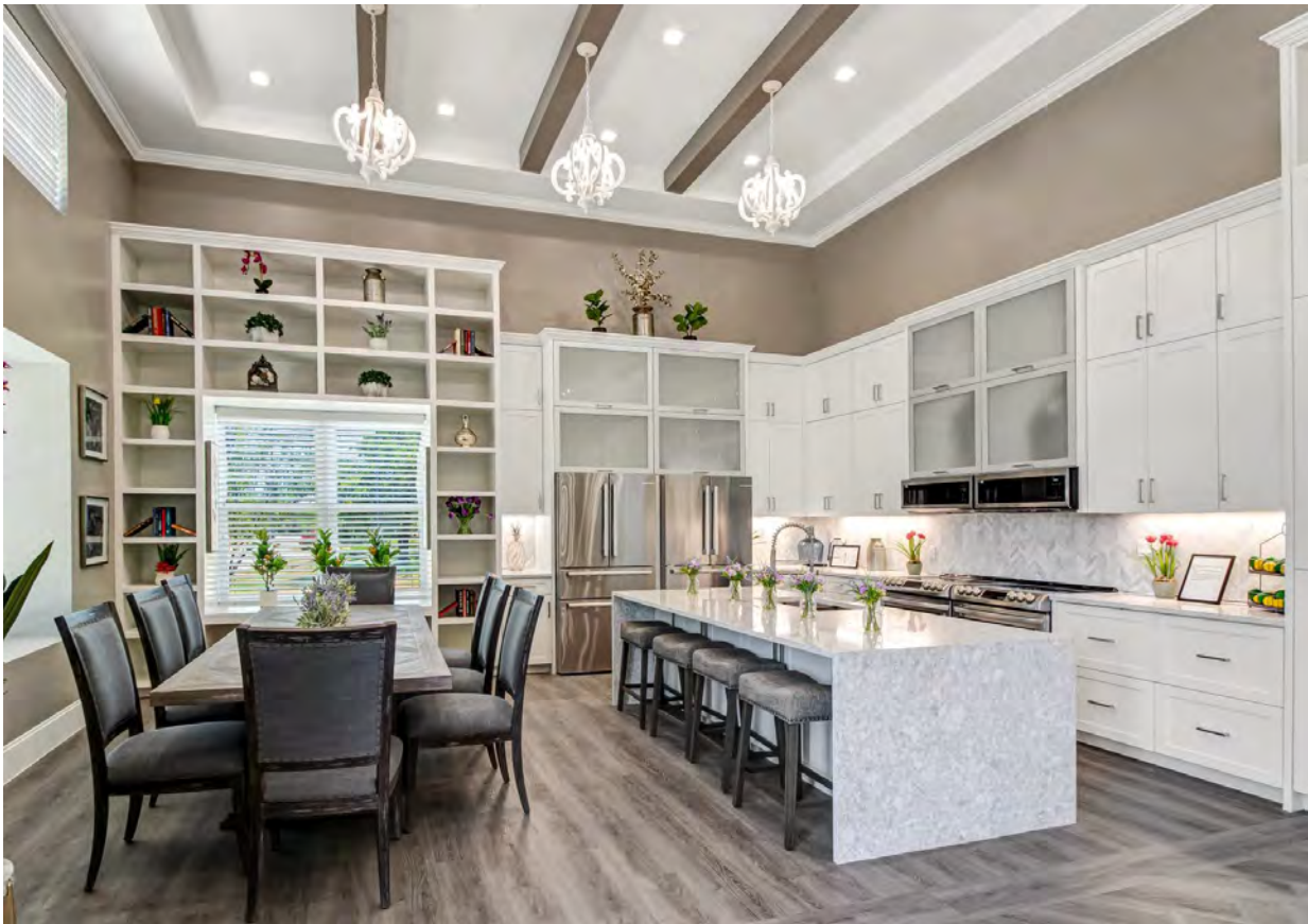
Project photos shown represent projects completed by current team members of Specialty Mod Construction and may or may not be a project of Specialty Mod Construction