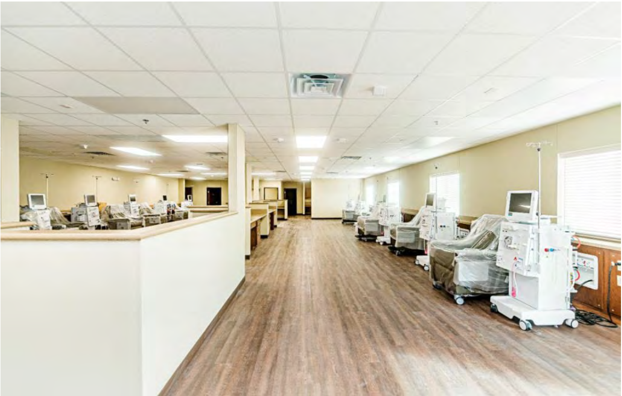
Project photos shown represent projects completed by current team members of Specialty Mod Construction and may or may not be a project of Specialty Mod Construction