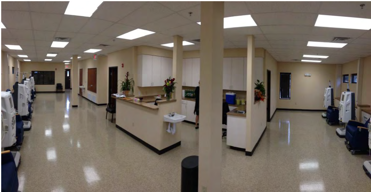
Project photos shown represent projects completed by current team members of Specialty Mod Construction and may or may not be a project of Specialty Mod Construction