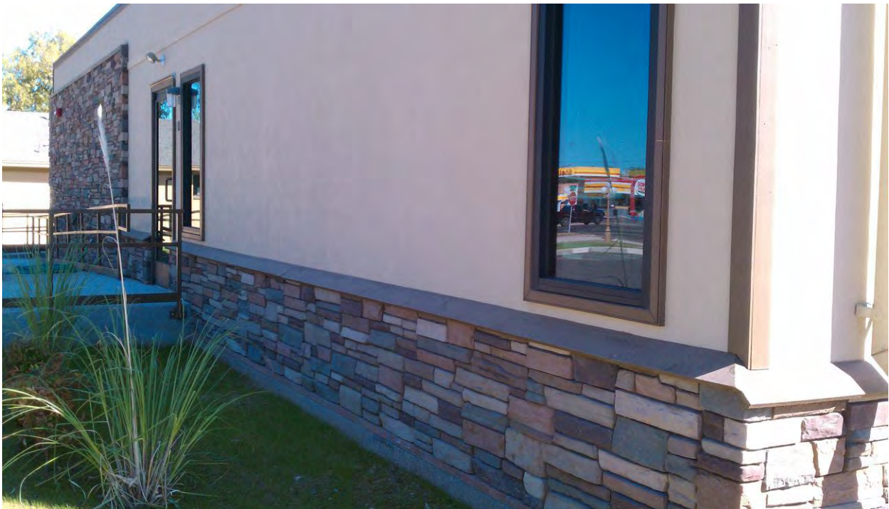
Project photos shown represent projects completed by current team members of Specialty Mod Construction and may or may not be a project of Specialty Mod Construction