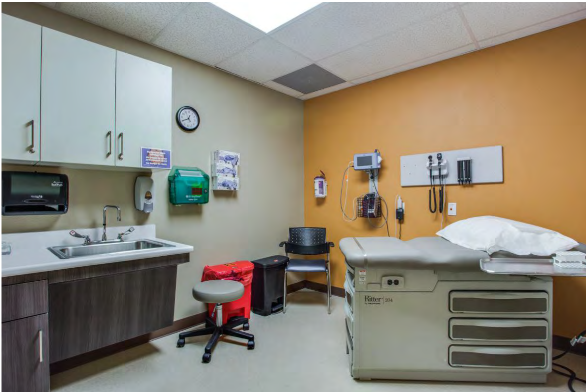
Project photos shown represent projects completed by current team members of Specialty Mod Construction and may or may not be a project of Specialty Mod Construction