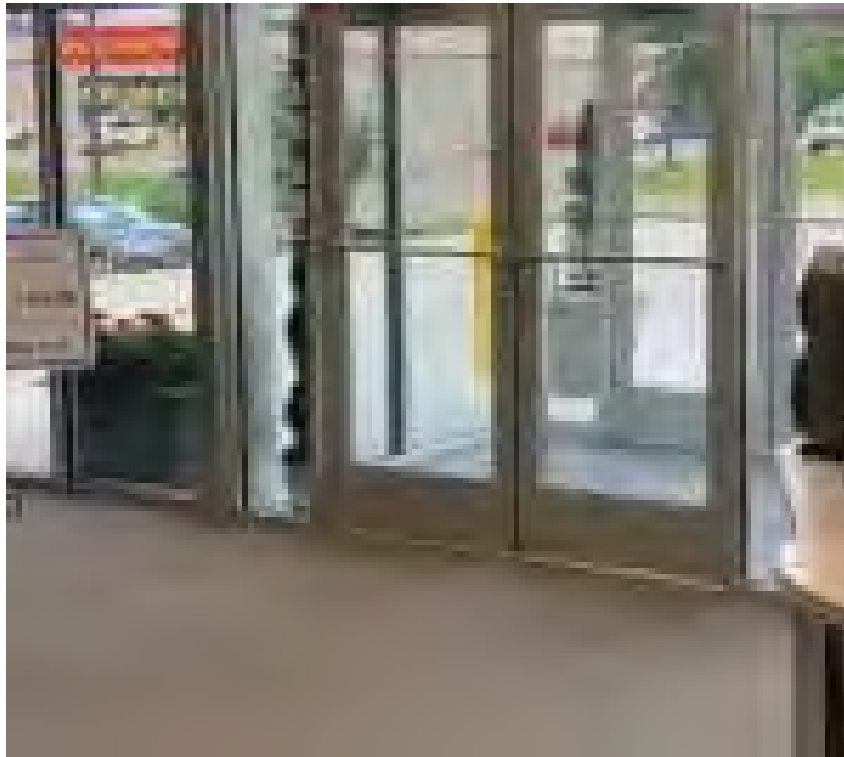
Project photos shown represent projects completed by current team members of Specialty Mod Construction and may or may not be a project of Specialty Mod Construction