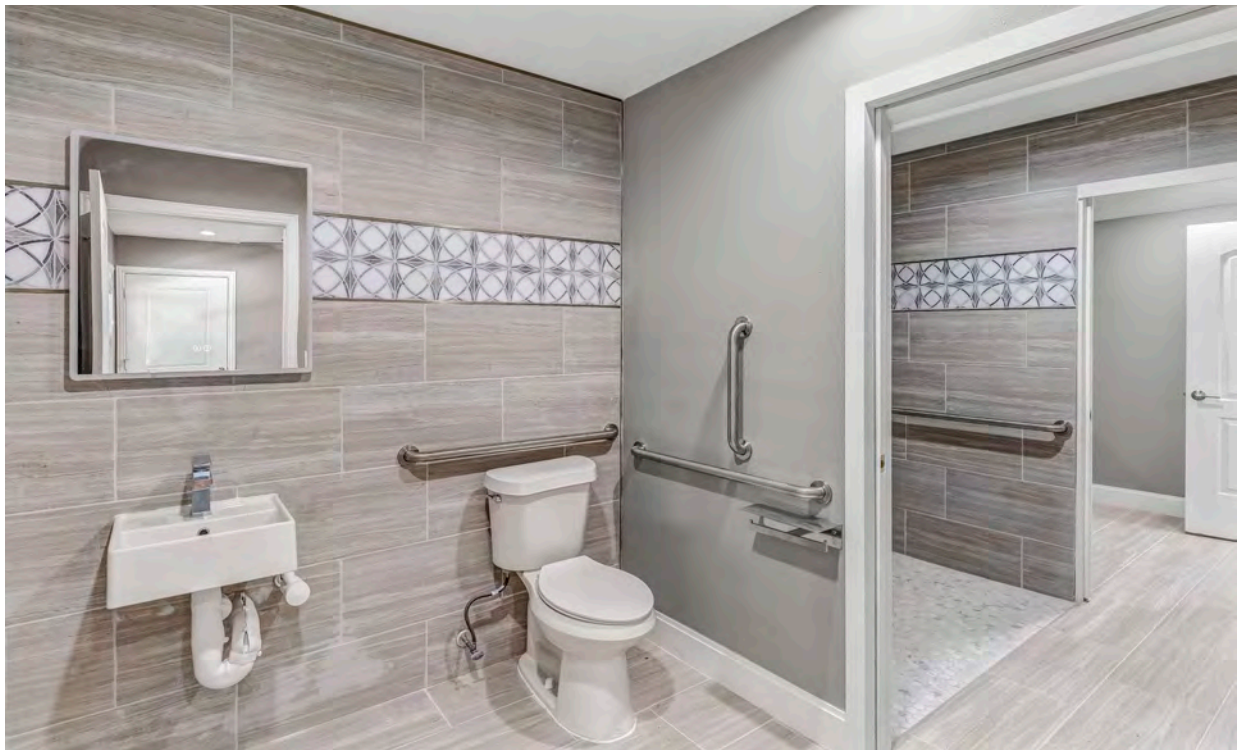
Project photos shown represent projects completed by current team members of Specialty Mod Construction and may or may not be a project of Specialty Mod Construction