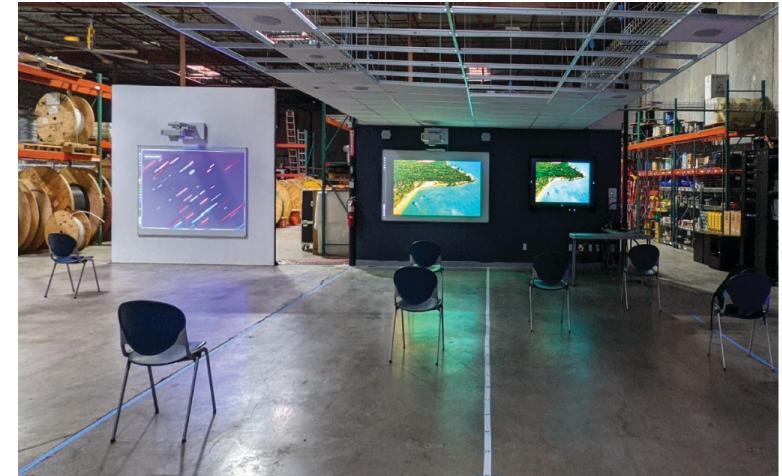
Image 1: 116" & 106" Screen Boards with EPSON BrightLink 1485Fi Interactive Projector vs. 65" Interactive Display.

The demonstration of MCA-certified specialized solutions compared the EPSON BrightLink 1485Fi Interactive Projector on a 106" Screen Board and a 116" Screen Board to a 65" Interactive Display, as well as teacher technology control on the wall, allowing the teacher to change technology sources from a single location.