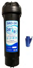
SAO-24 Cartridge & Desiccant Filter