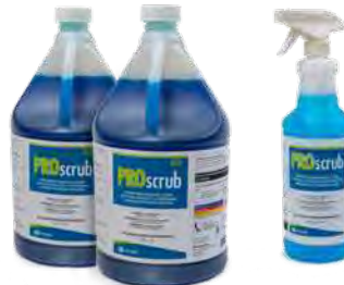
PROscrub RTD & RTU