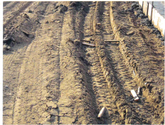
Example of failed subgrade

Let Byrne & Jones Stabilization show you the benefits of soil stabilization before you begin your next project.