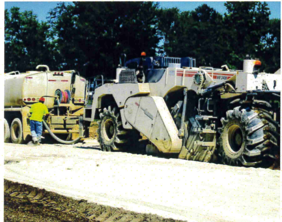
Soil stabilization in process

For more information, contact us at: www.byrneandjones.com