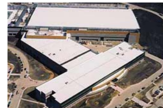
Texas Instruments RFAB Building