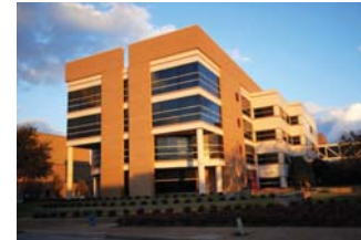
University of Houston Science Center