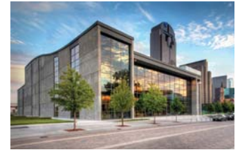
Dallas Performance Hall