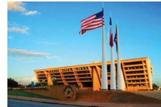
Dallas City Hall