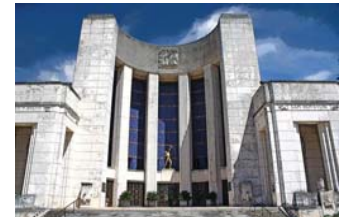
Hall of State