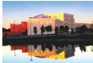
Cedar Hill Government Center