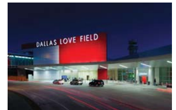
Love Field Airport