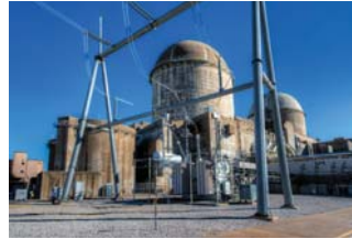
Comanche Peak Nuclear Plant