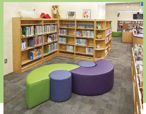
Bloom & Durecon Wood