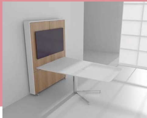
Palmieri Social Media®