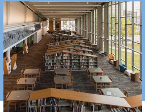
Canopy Top & Fusion