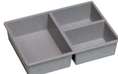
3 Division Short Insert