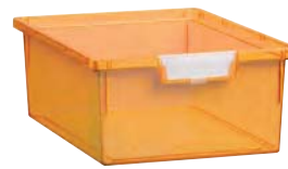
Crystal Neon orange