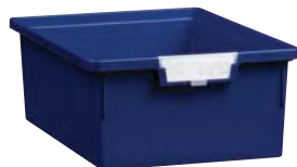
Bold Dark Blue