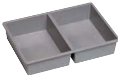
2 Division Insert