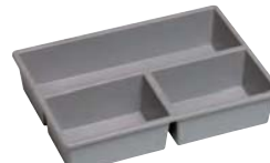
3 Division Long Insert