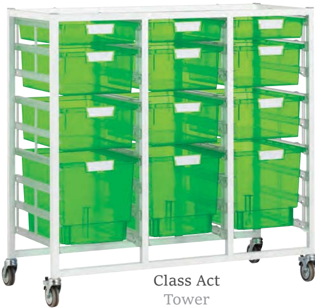
Class Act Tower