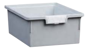
Primary Cool Gray