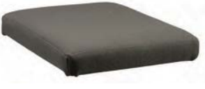
Primary Cool Gray