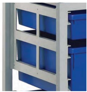
Metal Light Gray