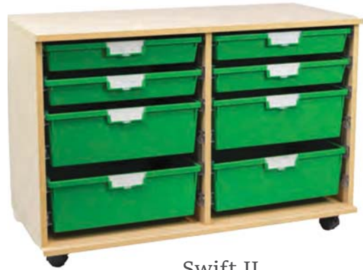
Swift II Cart