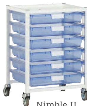
Nimble II Cart