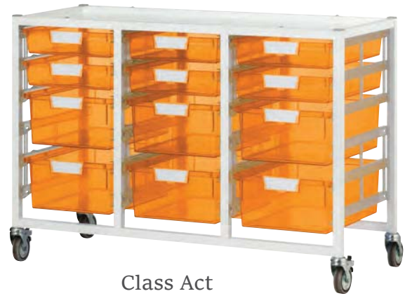
Class Act Cart