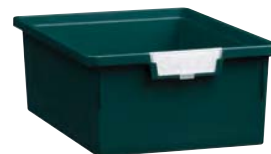
Bold Jade Green