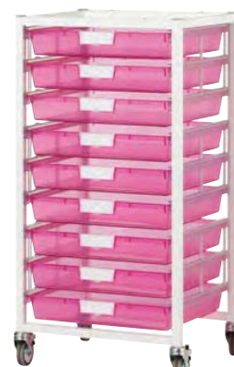
Nimble II Tower