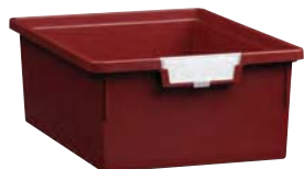
Bold Burgundy Red