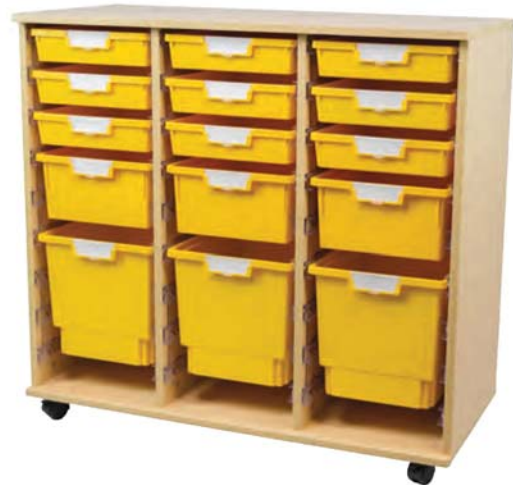
Class Act Tower