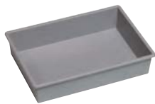
1 Division Insert

Function: Removable, interchangeable Inserts nest within Slim Line Tote Trays. Provides proximity access to needed materials for collaborative learning.