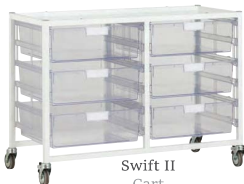
Swift II Cart