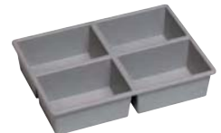
4 Division Insert