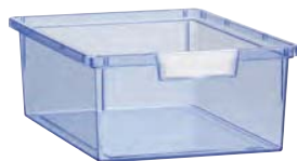
Crystal Tinted Blue