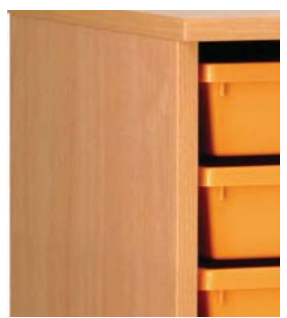
MFC Pearwood Finish