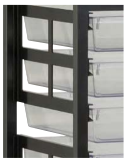
Metal Dark Gray