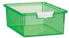
Crystal Neon Green