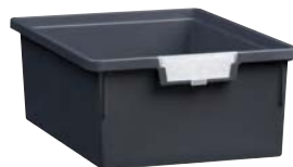
Bold Dark Grey