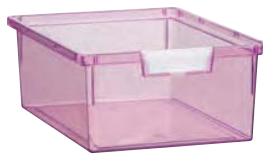
Crystal Tinted Purple