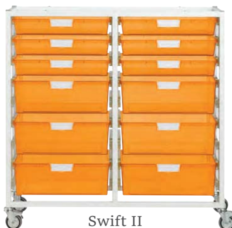
Swift II Tower

Durable Construction: Front and rear fully welded, 1” square, 16-gauge steel tube frames with baked-on epoxy finish. Top panels constructed from 18-gauge formed steel sheets with baked-on epoxy finish. Glide & Tilt® Structural Runners, molded from engineering grade ABS, secured to steel tube frames. Lockable heavy-duty rubber casters support over 400 lbs. per cart.