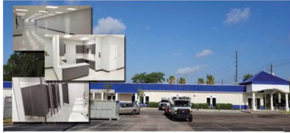
Project: Triumph High School Academy, Brownsville Texas /

We are corporate backed by knowledgeable individuals with more than 20 years of combined experience in industrial, commercial construction and MEP and Civil design.