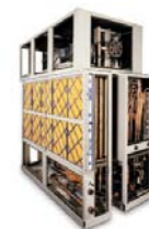
Indoor Cooling & Heating Water-cooled Condenser – Retrofit