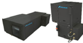
SmartSource® High Efficiency Horiz. / Vert. ½ to 6 tons