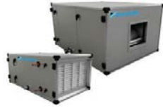
Destiny® Commercial Indoor Air Handler