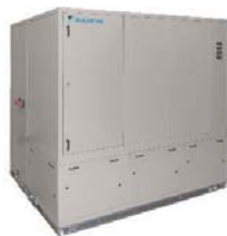
Indoor Cooling & Heating Water-cooled Condenser – Unitary