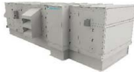
Skyline® Semi-Custom Outdoor Air Handler