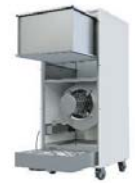
Air Purifier 500 & 1000 cfm