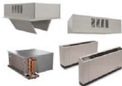
ThinLine Vertical & Horizontal 200 to 1,200 cfm