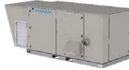
Rebel® Commercial Outdoor Air Handler