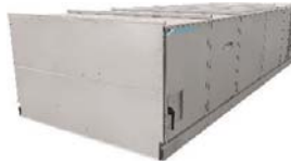
RoofPak® Semi-Custom Rooftop Air Handler