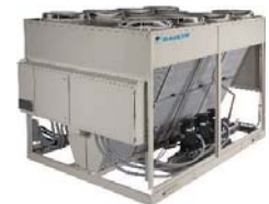
Dual Circuit Scroll Condenser