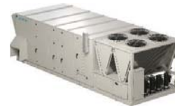
Rebel Applied™ Heating & Cooling w/Inv. Compressor