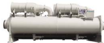
Centrifugal Chiller, Dual Compressor – Dual Circuit