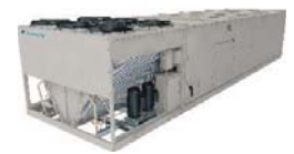
RoofPak® Heating & Cooling w/Inv. Compressor