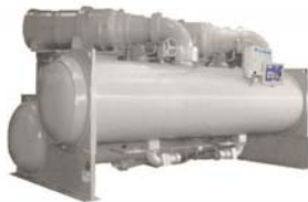
Centrifugal Chiller, Dual Compressor – Single Circuit