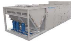
Maverick® II Cooling & Heat Pump