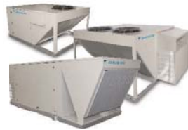
Rebel® Cooling and Heat Pump w/Inv. Compressor