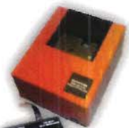
FIREYE FLAME MONITOR AND DISPLAY