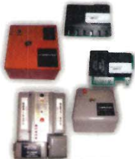
FIREYE BURNER CONTROLS AND MODULES

WE REPAIR THOUSANDS OF ITEMS AND HUNDREDS OF MANUFACTURERS CALL FOR PRICING AND AVAILABILITY