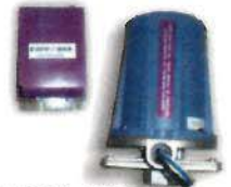
HONEYWELL FLAME SAFEGUARD AND AMPLIFIERS