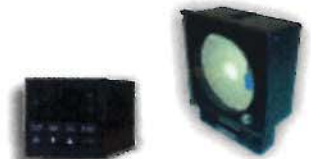
RECORDERS AND UDC'S