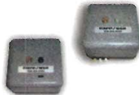
HONEYWELL FLAME RELAYS

WE REPAIR THOUSANDS OF ITEMS AND HUNDREDS OF MANUFACTURERS CALL FOR PRICING AND AVAILABILITY