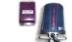
HONEYWELL FLAME SAFEGUARD AND AMPLIFIERS