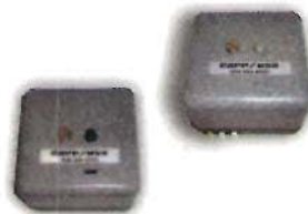
HONEYWELL FLAME RELAYS

WE REPAIR THOUSANDS OF ITEMS AND HUNDREDS OF MANUFACTURERS CALL FOR PRICING AND AVAILABILITY