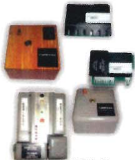
FIREYE BURNER CONTROLS AND MODULES

WE REPAIR THOUSANDS OF ITEMS AND HUNDREDS OF MANUFACTURERS CALL FOR PRICING AND AVAILABILITY