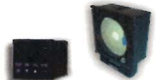
RECORDERS AND UDC'S