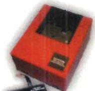
FIREYE FLAME MONITOR AND DISPLAY