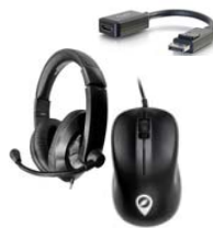
Headphones, Cables & Mice