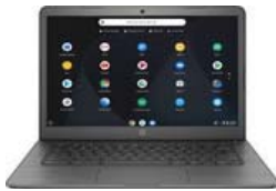
Chromebooks & Laptops