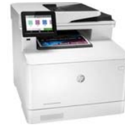
Printers & Toner