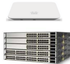
Access Points & Switches