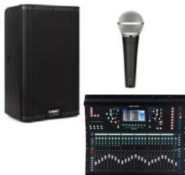
Microphones, Speakers & Mixers