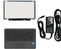
Chargers & Parts