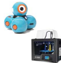
Robotics & 3D Printers