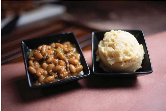
Sides: Baked Beans, Mac n Cheese, Potato Salad, Coleslaw, Pinto Beans