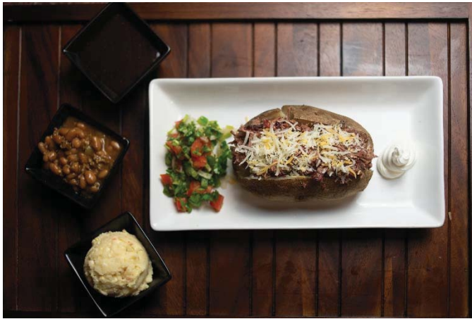
Bam Bam Loaded Baked Potato