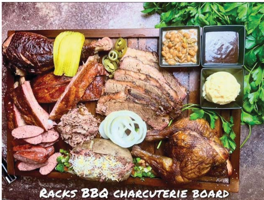
Racks BBQ Charcuterie Board