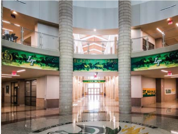
Wall Vinyl – Entrance Rotunda