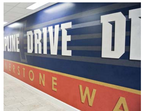
Wall Vinyl – Hallway