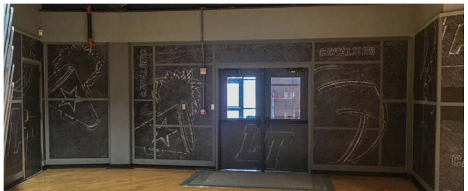
Composite Panels & Vinyl – Side Entrances