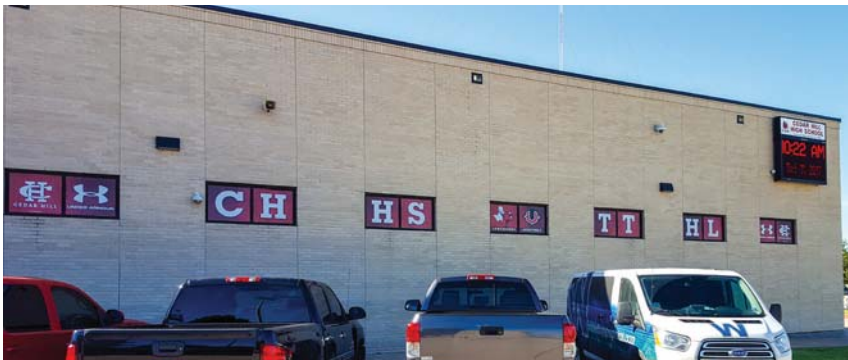
Window Perf – Outside of Weight Room Windows