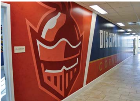
Wall Vinyl – Hallway