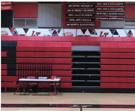
Sponsor Signs to replace