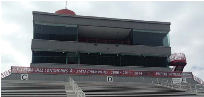
Custom Mesh Windscreen