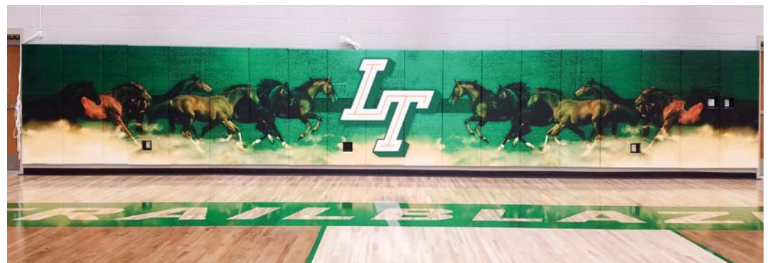
Vinyl – Gym Mats