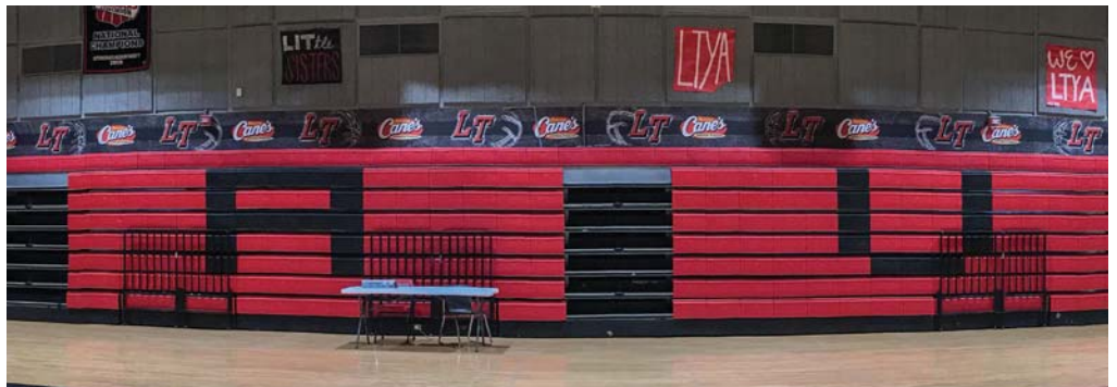
Composite Panels – Sponsor Signs