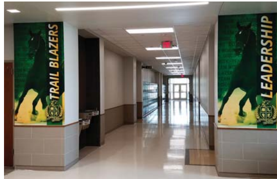
Composite Panels – Hallway End-caps