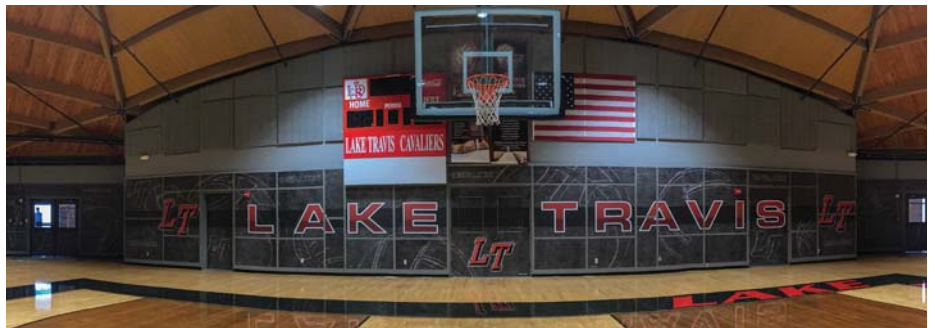
Gym with Composite Panels installed