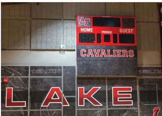
Vinyl – Scoreboard