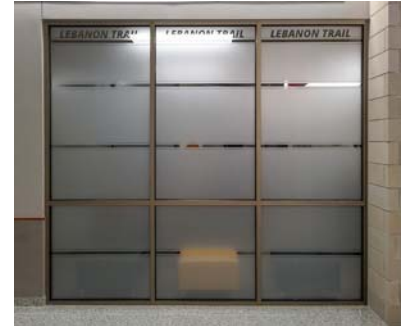
Frosted Vinyl – Counseling