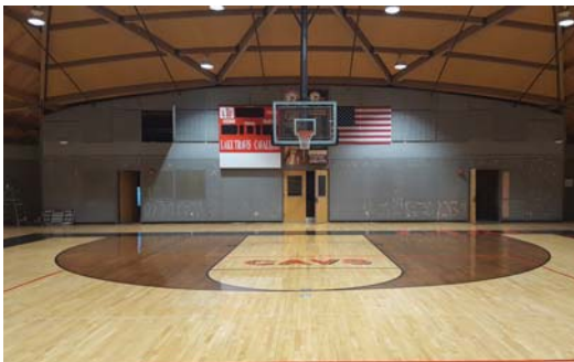
Gym surface prior to installation