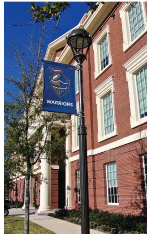
Pole Banners – Entrance