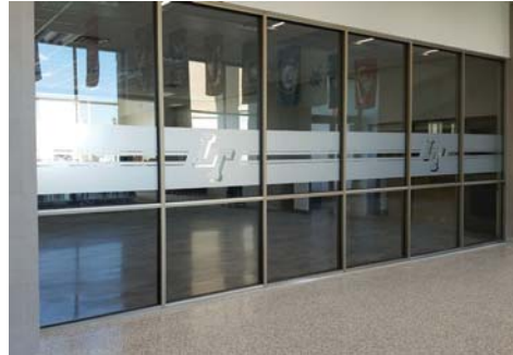
Frosted Vinyl – Hallway