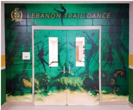
Vinyl – Arts Entrance