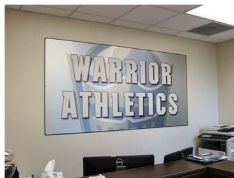
Aluminum Sign – Direct Print