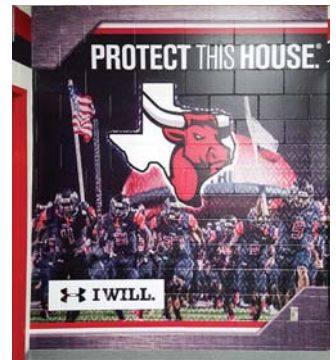
Wall Vinyl – Locker Room Entrance & Exit