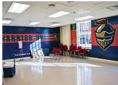
Wall Vinyl – Fieldhouse