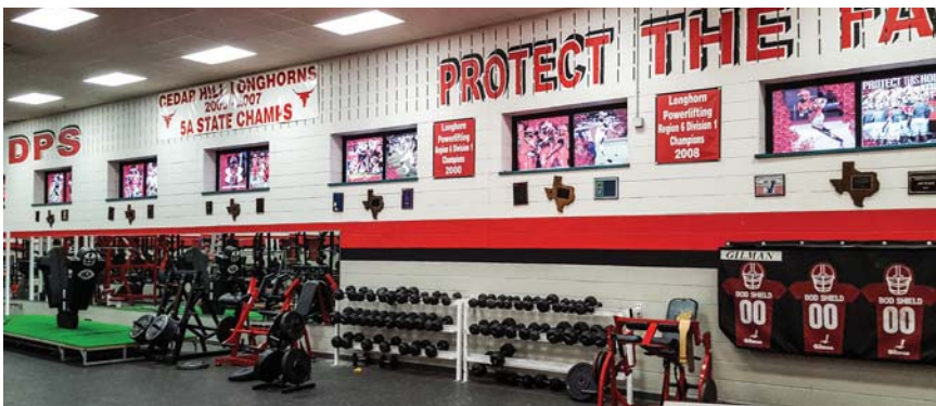
Translucent Vinyl – Inside of Weight Room Windows