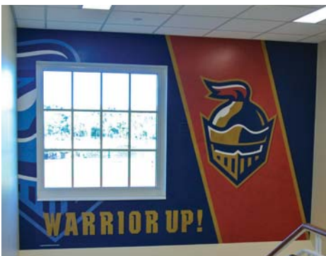
Wall Vinyl – Staircase