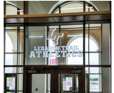
Frosted Vinyl – Athletics