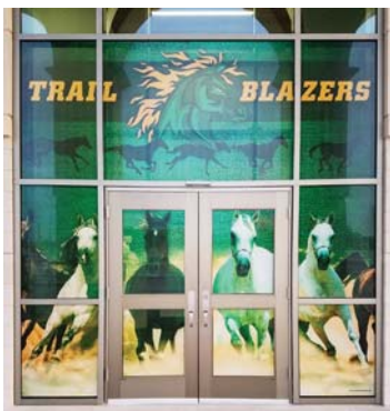
Window Perf – Athletics