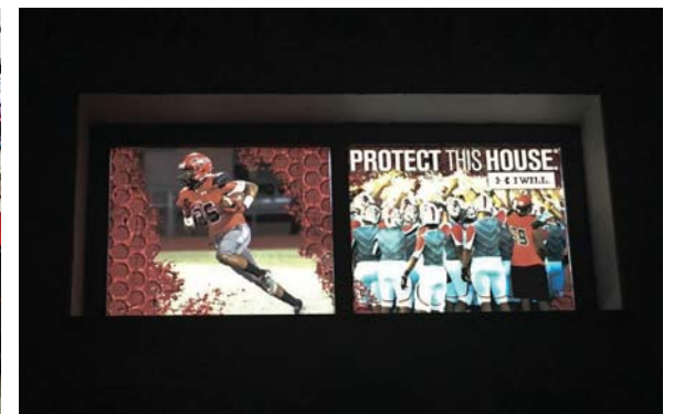
Translucent Vinyl – Lights Off