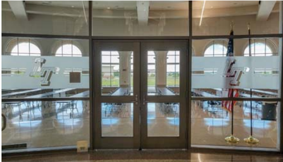
Frosted Vinyl – Library Entrance