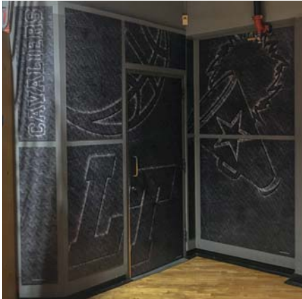
Composite Panels, Door Vinyl