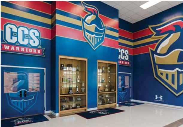
Wall Vinyl – Gymnasium Entrance