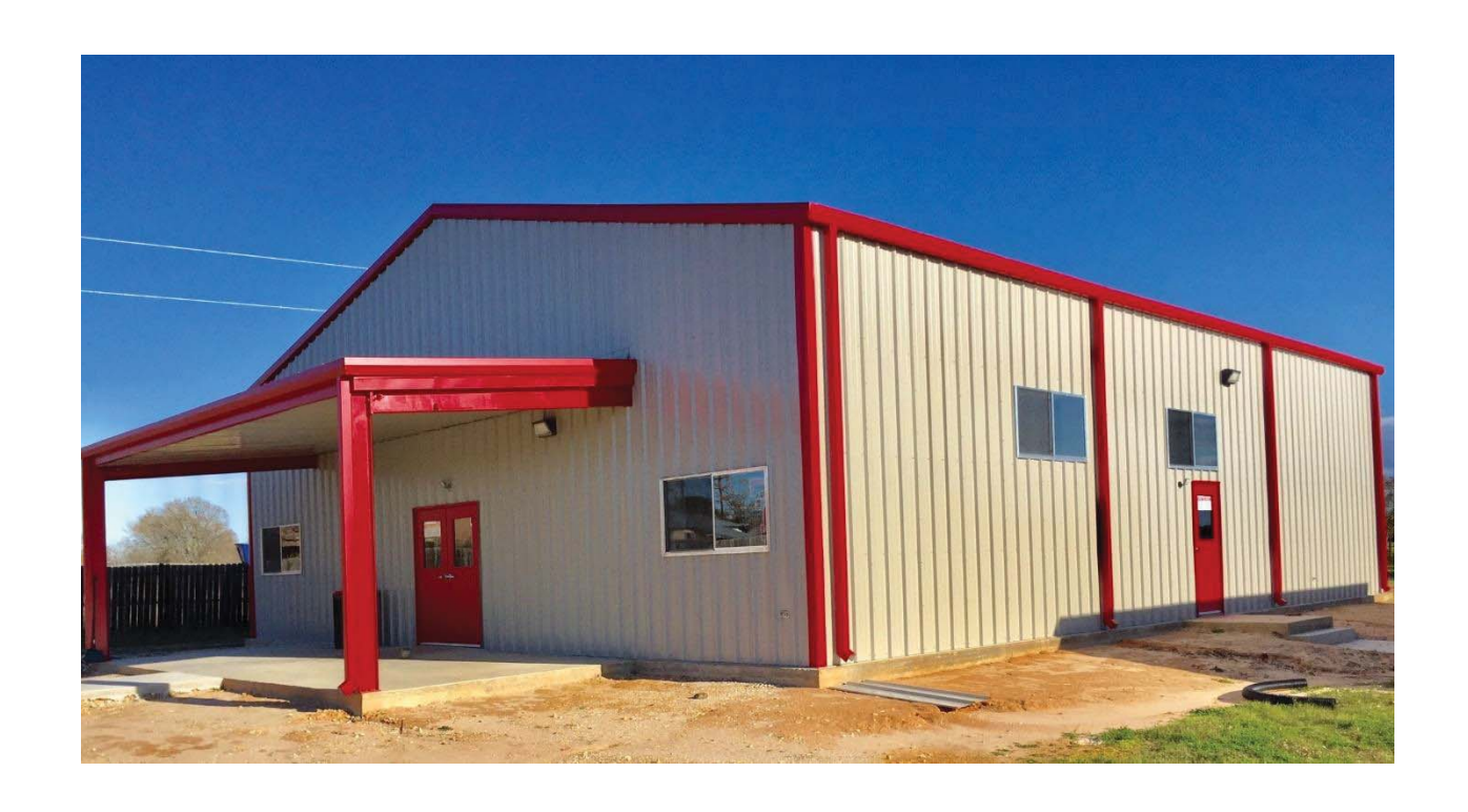
McDade ISD – Band Hall