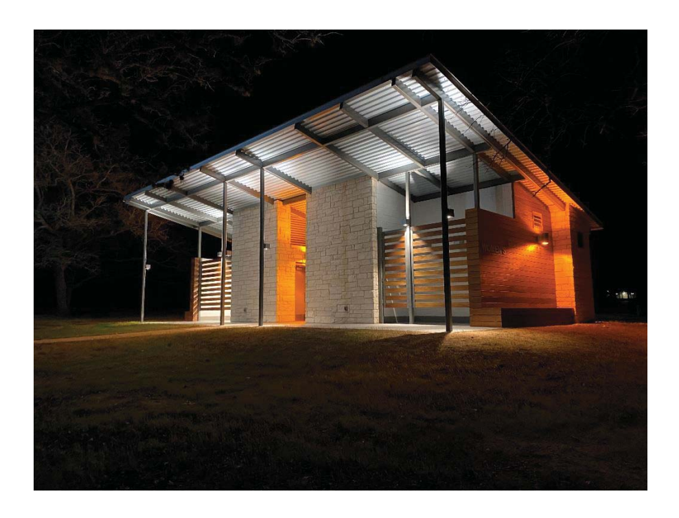
LCRA – North Shore Park Lake Bastrop Restroom Building