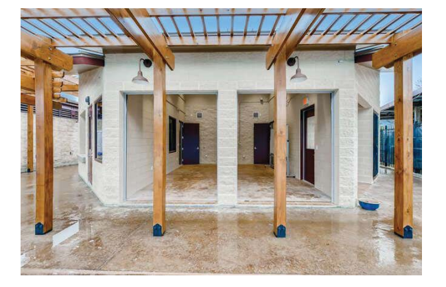
Brushy Creek MUD – Sendero Springs Pool House