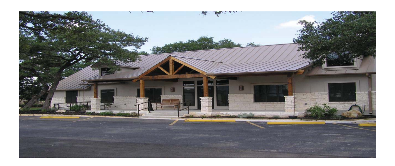
Point Venture MUD – Office Building