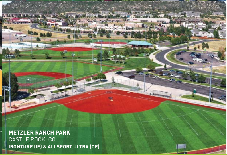
METZLER RANCH PARK CASTLE ROCK, CO IRONTURF (IF) & ALLSPORT ULTRA (OF)

For assistance with the specific requirements of your project, including infill and pad, please reach out.