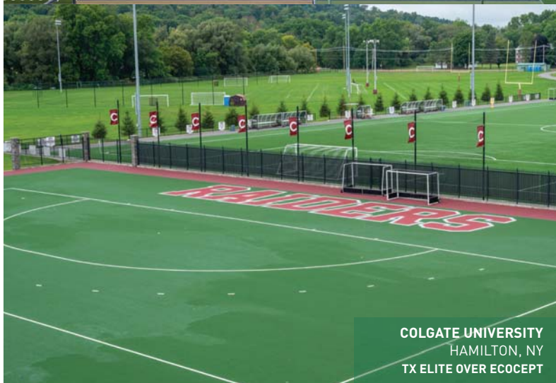
COLGATE UNIVERSITY HAMILTON, NY TX ELITE OVER ECOCEPT