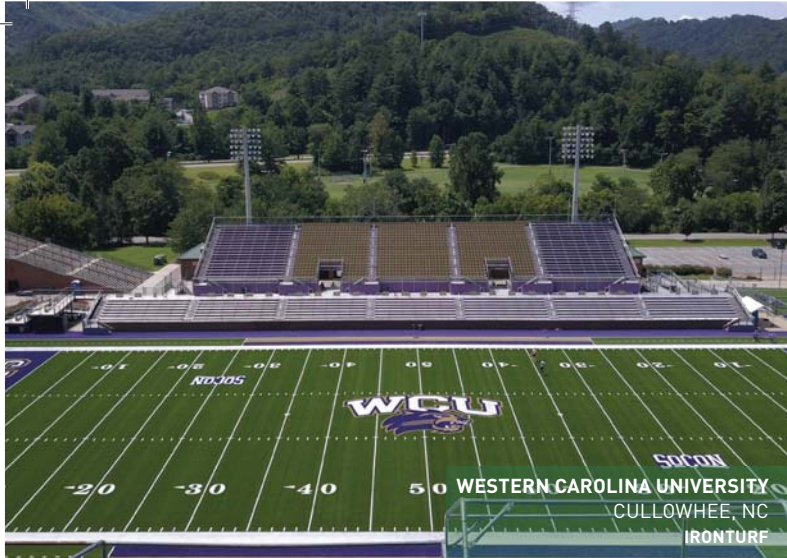
WESTERN CAROLINA UNIVERSITY CULLOWHEE, NC IRON TURF