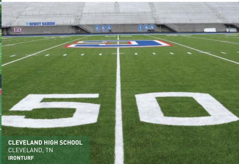
CLEVELAND HIGH SCHOOL CLEVELAND, TN IRON TURF