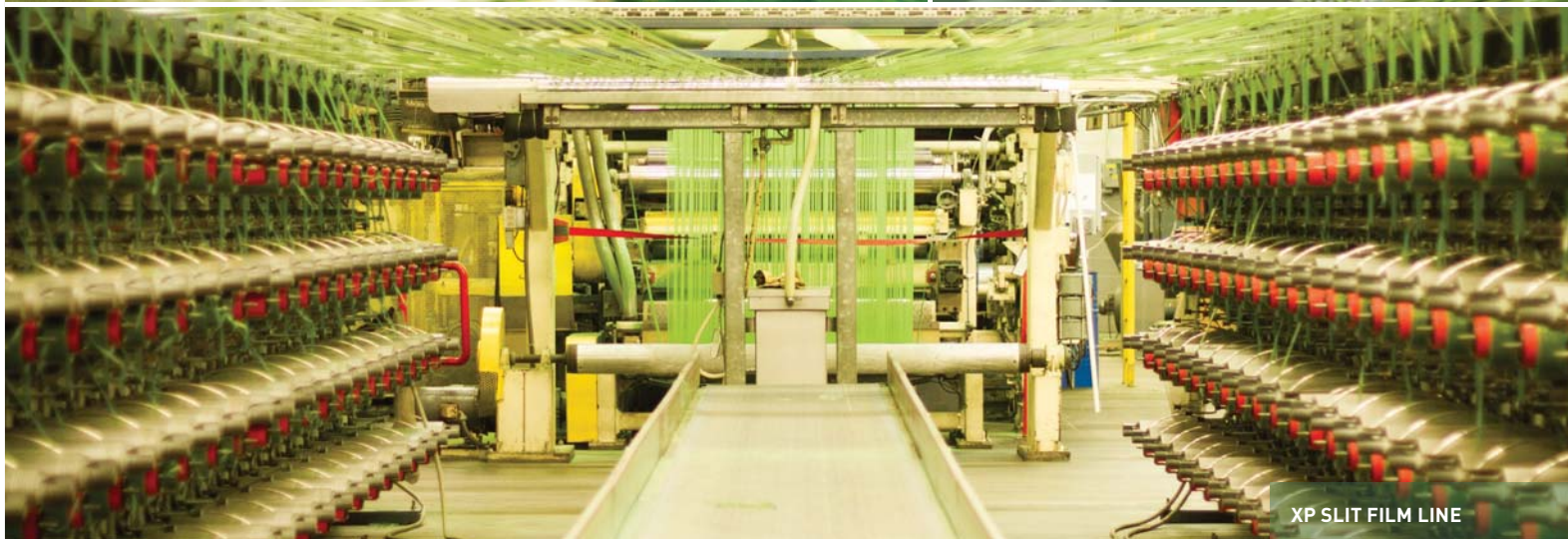
XP SLIT FILM LINE