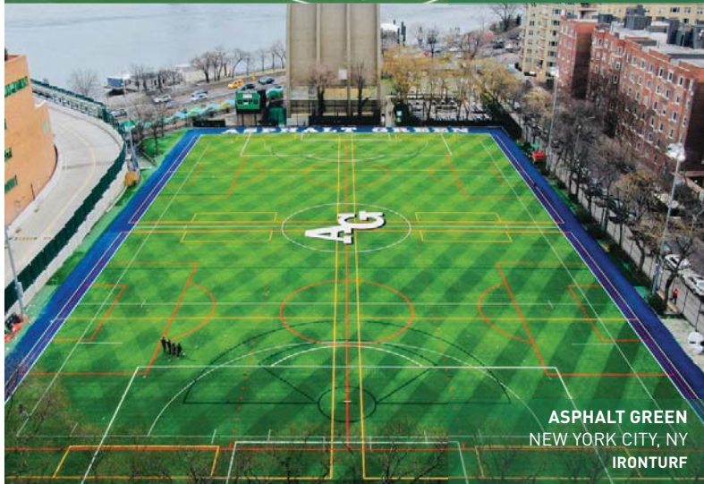
ASPHALT GREEN NEW YORK CITY, NY IRON TURF