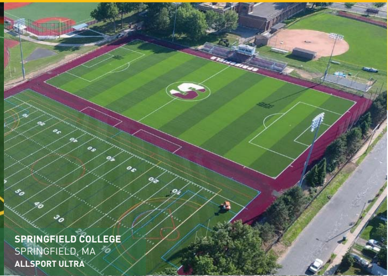
SPRINGFIELD COLLEGE SPRINGFIELD, MA ALLSPORT ULTRA