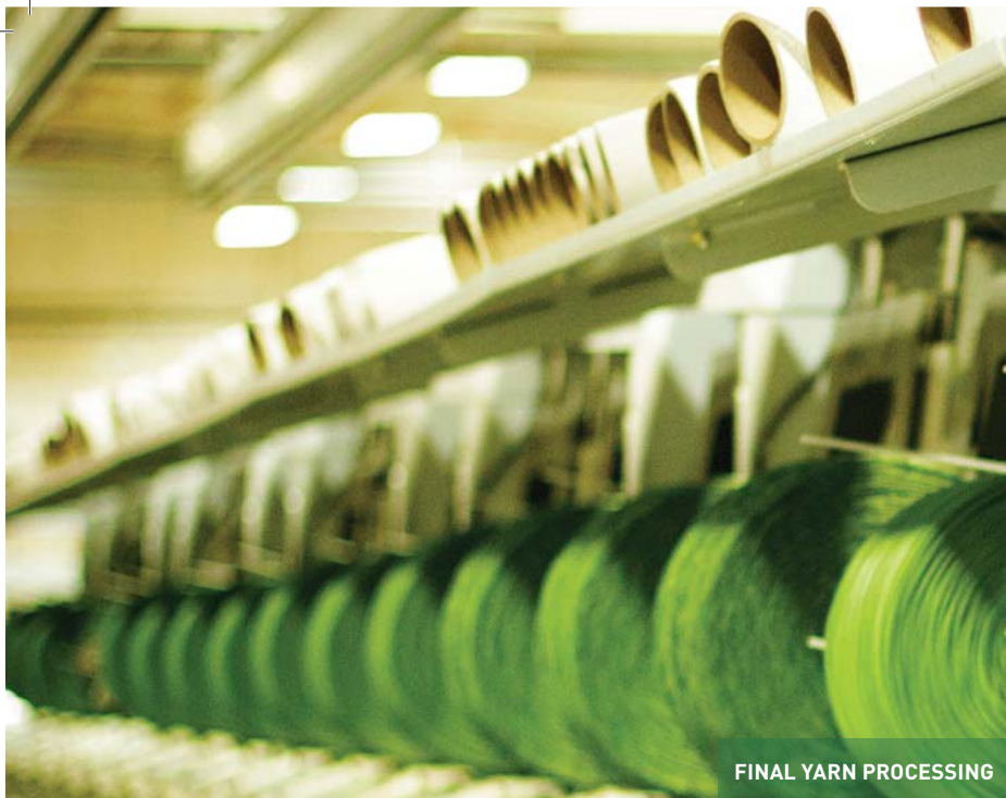
FINAL YARN PROCESSING