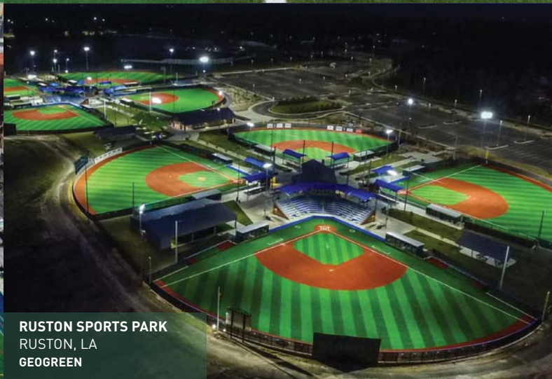
RUSTON SPORTS PARK RUSTON, LA GEOGREEN