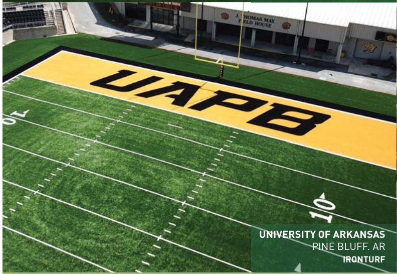
UNIVERSITY OF ARKANSAS PINE BLUFF, AR IRONTURF