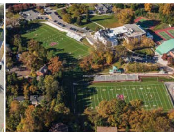
Boys' Latin School - Baltimore, MD