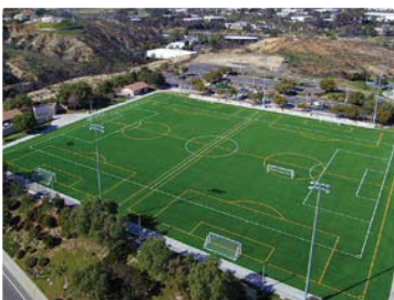
Aviara Park - Carlsbad, CA