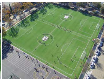
Beverly Vista School - Beverly Hills, CA