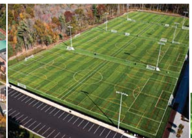
Fore Kicks Soccer Complex - Taunton, MA