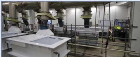
HIGH TECH CLEANROOM