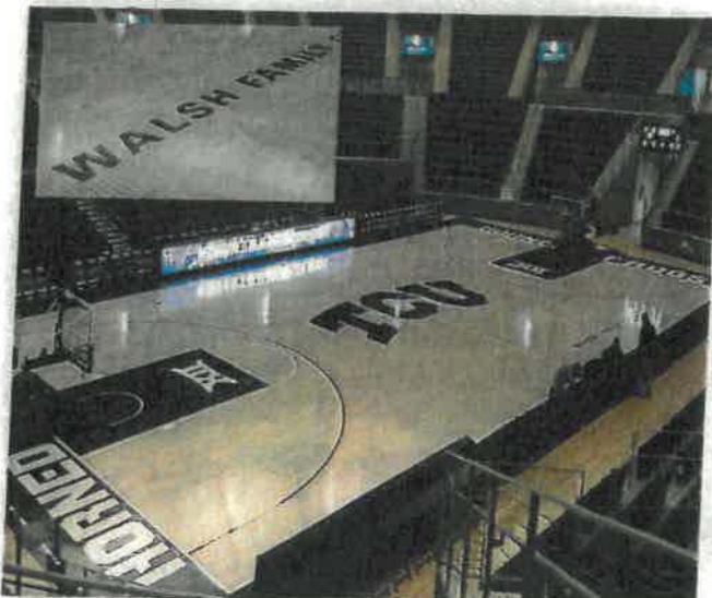
TCU Nike Frogskin Court, Ft. Worth TX