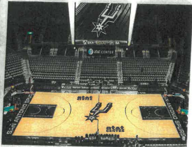
San Antonio Spurs, TX