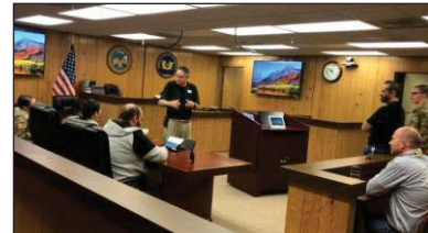
E-Logic provides onsite user training after implementing a video telecommunications system upgrade with NIPRnet and SIPRnet capabilities.

E-Logic has the experience and knowledge in implementing training sessions as part of our train-the-trainer model. This model allows the customer to understand new technologies, making new systems user-friendly, and adaptable to the user with the objective to reduce dependency and retaining customer autonomy.