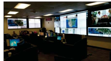
The 115 th Fighter Wing can rely on E-Logic to design, install, program, integrate and manage its entire war room.

One solution does NOT fit all. Our Subject Matter Experts work with our customers to design the right solution based on their current necessities and future requirements. Therefore, E-Logic has teamed with variety of OEMs to bring new technologies to the hands of our customers.