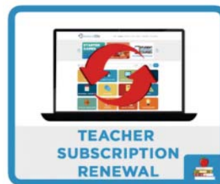
TEACHER SUBSCRIPTION RENEWAL $99.00