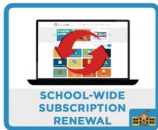
SCHOOL-WIDE SUBSCRIPTION RENEWAL $999.00