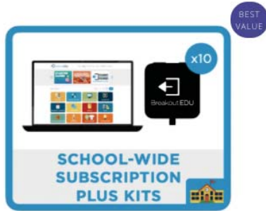
SCHOOL-WIDE SUBSCRIPTION PLUS KITS $1,999.00 $2,690.00 SAVING $690.00