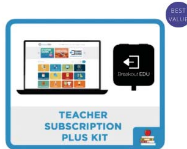
TEACHER SUBSCRIPTION PLUS KIT $179.00 $238.00 SAVING $59.00