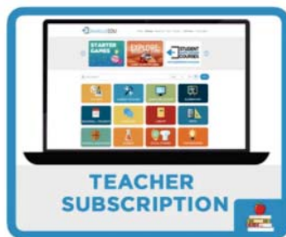
TEACHER SUBSCRIPTION $99.00