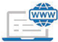
WEBSITE & CMS