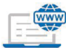
WEBSITE & CMS